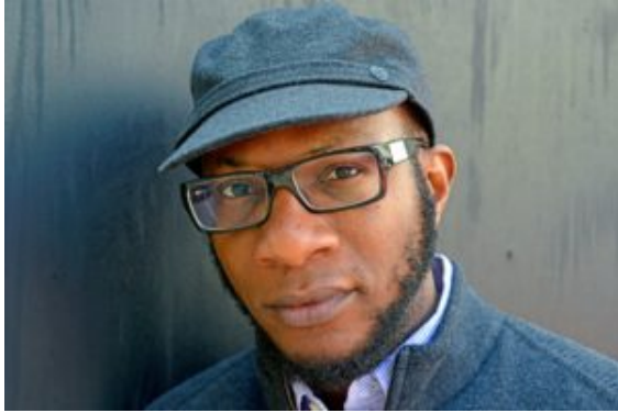
Teju Cole, b. 1975

and engaging in intellectual but emotionally fraught conversations with friends and strangers along the way. As with most of Sebald's works, we gradually learn of secret crimes and forgotten traumas that are not-so-neatly hidden away in the subconscious. It is a powerful and important debut novel.