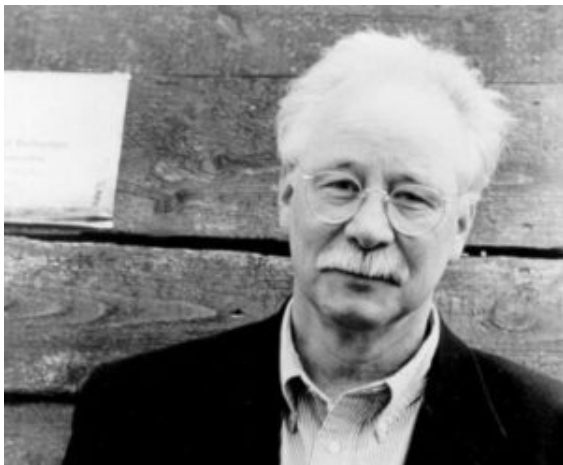
W.G. "Max" Sebald, 1944-2001

seemingly exactly like Sebald, wandering around Europe and recollecting, often at second or third hand, the stories of places and people he encounters. They all deal indirectly with the paradoxical European legacy of Humanism and inhumanity, in which scientific and cultural development sits alongside constant imperialist war and exploitation. He focuses especially on World War Two and the Holocaust, treating this history in comparably non-traditional ways as, for example, recent Nobel laureates Patrick Modiano and Svetlana Alexievich (in 2001, the Nobel Committee chair said that Sebald, along with Derrida, were two recently deceased authors who were under consideration for the prize).