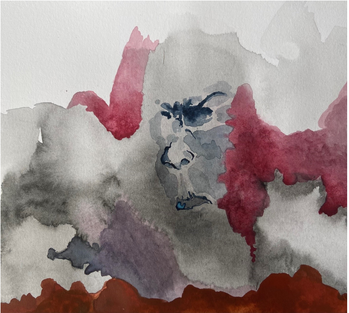
“Tabt forbindelse/Lost Connection”

There is also a self-portrait entitled “Tabt forbindelse/Lost Connection” from October 11. There is a disembodied head attached to tendrils with a green object next to the cheek. Both of these works connote a sense of loss, even a dissociation from one’s own body.