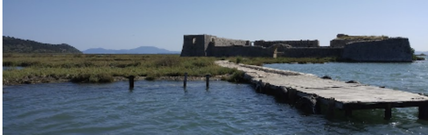
Castle of Ali Pasha Tepelena, Butrint, 2022

for defying the Sultan and running his governorate as an almost-autonomous Albanian state. For the last of these, Ali Pasha's head was paraded through Istanbul on a silver plate in 1822.