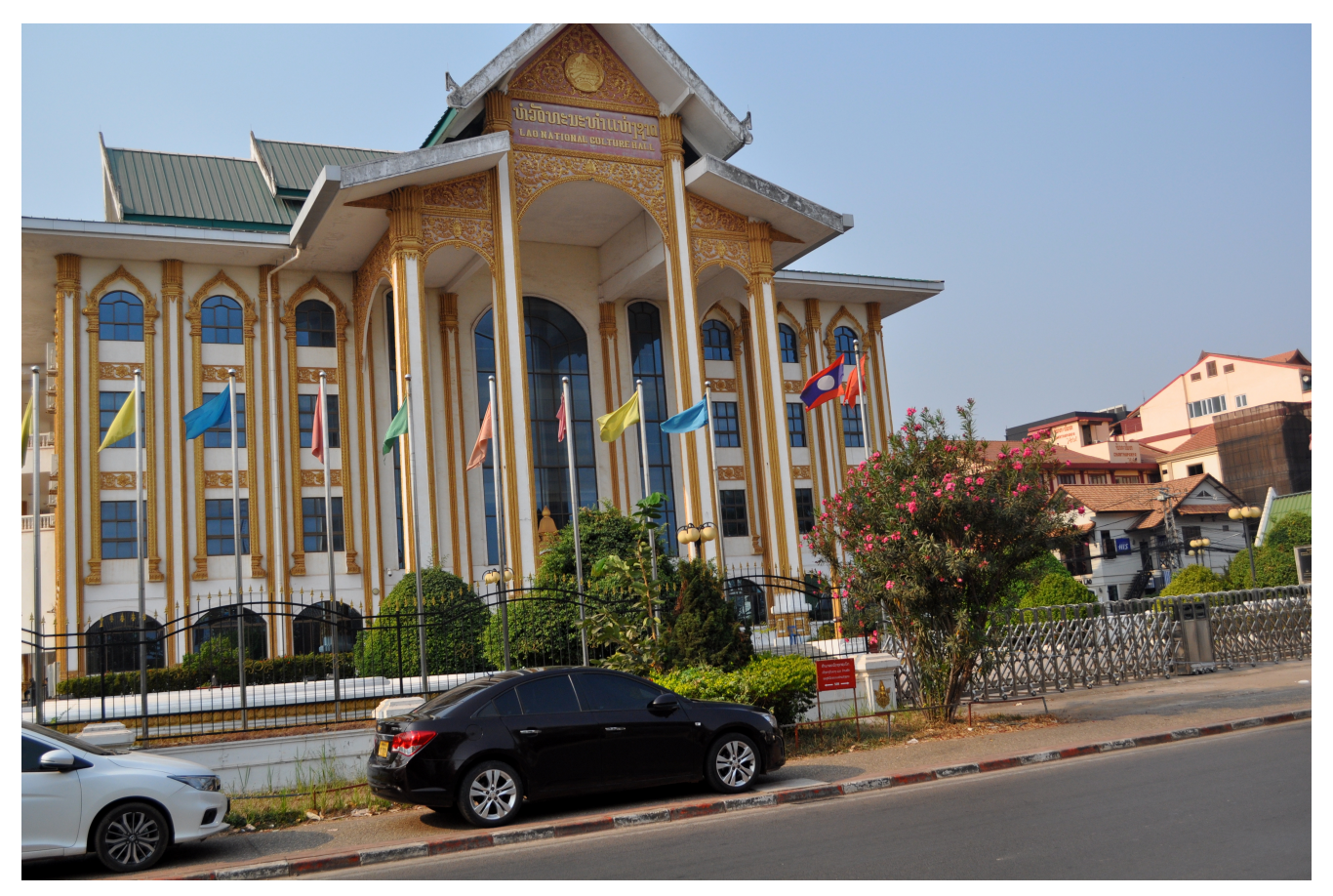
The cultural hall where the forum took place.