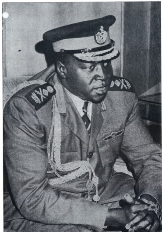
HIS EXCELLENCY GENERAL IDI AMIN DADA President of the Republic of Uganda