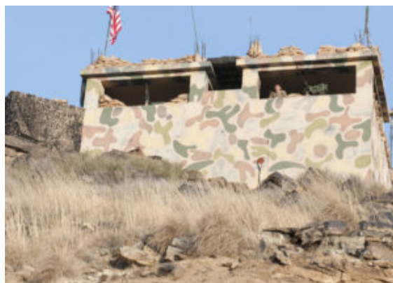
A soldier peeks

History prefers Colombo's version. So do I.