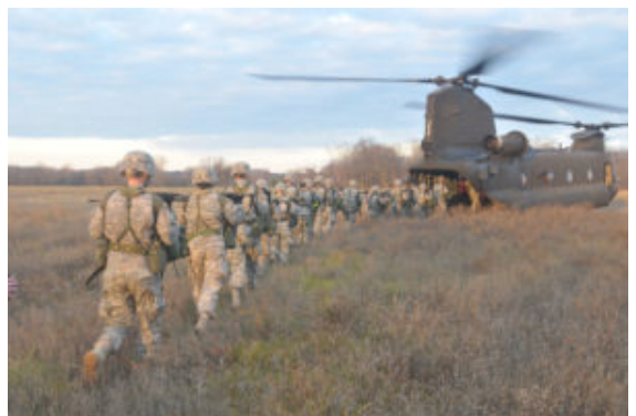
Cadets file into