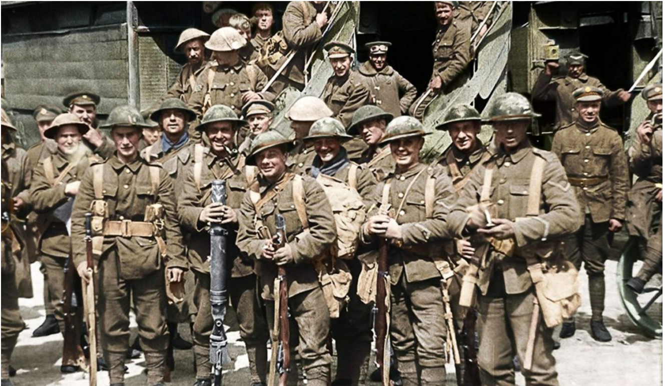
Still from Peter Jackson's 'They Shall Not Grow Old.'

There are moments—a few—in the voice-overs where a note of fatalism or horror or even protest will arise. Mild moments, expressed with little fervor, which seem to be included only to evoke veracity. At the end, we get a series of voices reminding us that war is useless, pointless, a waste. A series of voices that feels tacked-on, as though we as an audience of modern sensibilities expect to hear this condemnation. Overall, throughout the film we hear the stories of Tommies who were happy to be there, who'd "go over again," who missed it when they left, who saw it as "a job of work that had to be done." Is this the overarching experience of the average British soldier in the war?