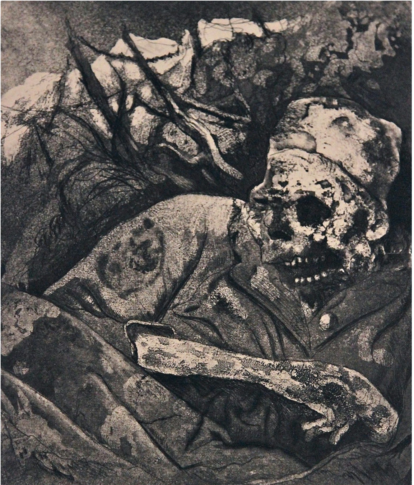
Otto Dix, "Corpse on Barbed Wire."

A group of Tommies, exhausted, huddled together in their trench, are positioned almost exactly like Dix's Resting Company , the only difference their uniforms. The parallels were too obvious to ignore; Jackson, in his years of searching through the footage provided by the War Museums, had clearly