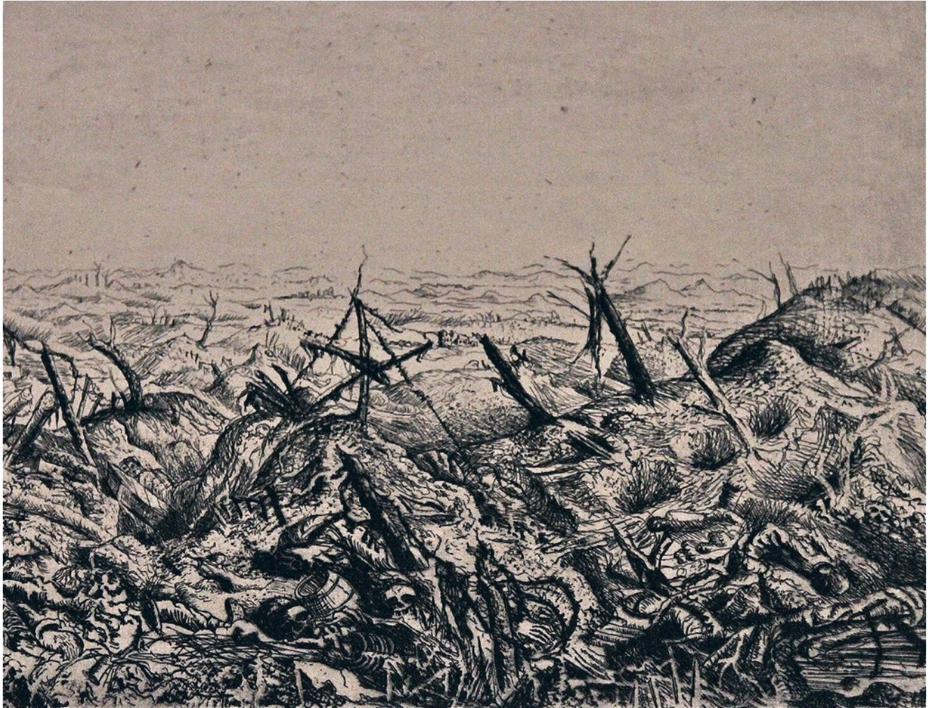
Otto Dix, "Near Langemarck (February 1918)."

Many times Jackson shows bodies dangling, untended and ignored, from barbed wire, akin to those from the War Triptych or the obviously named but no less striking Corpse on Barbed Wire .