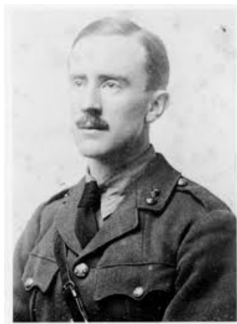
J.R.R. Tolkien in WWI uniform.

The issue of Tolkien's source material, and whether or not it is actively or casually racist, is one that encompasses far too great a scope for this review. Certainly Tolkien did not think himself a racist, and was a vocal opponent of Nazi racialist theories, even going so far as to send a series of nasty letters to a German publisher who wanted to reprint The Hobbit in the late '30s but only after confirming if Tolkien was "arisch"—that is, Aryan. He also hated apartheid, having been born in South Africa, and was similarly vocal in his condemnation of the practice.