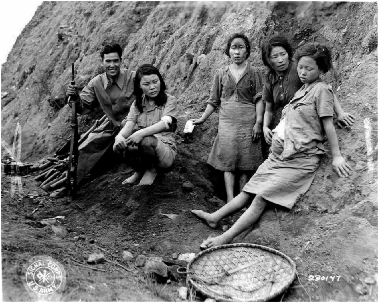
Chinese soldier with Korean 'comfort women' after they were liberated by US-China Allied Forces, Songshan, Yunnan Province, China. September 3, 1944