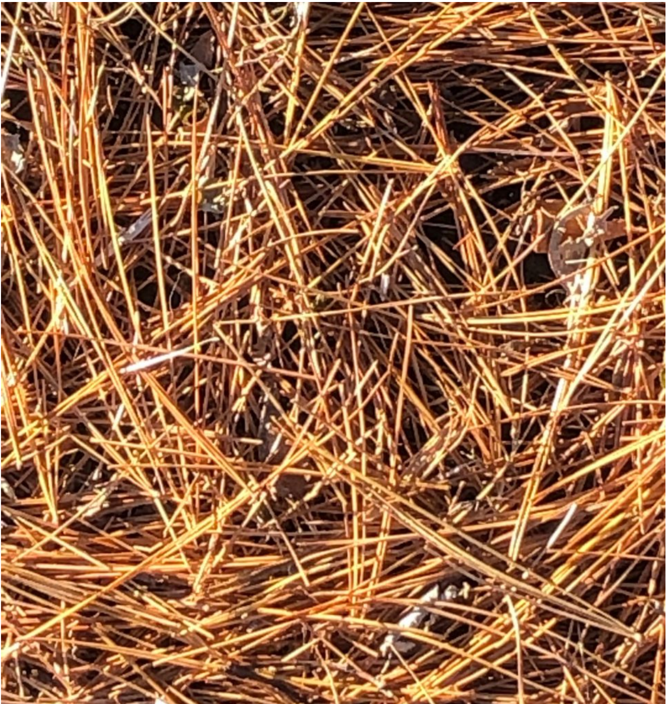
STRAW-BLONDE HAIR