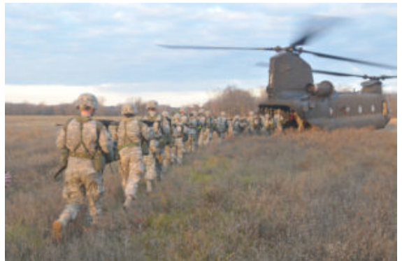
Cadets file into