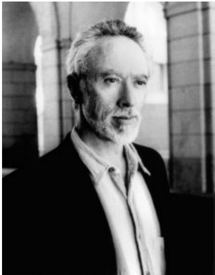
J . M . C o e t z e e

Coetzee was born in Cape Town in 1940 to white, liberal, middle-class Afrikaans parents who insisted on speaking English at home and sending him to English, rather than Afrikaner schools. He was a sensitive, poetry-loving child in a land of ruddy, big-boned, bullying brutes who maintained violent separation of blacks and whites, all of which gave him a life-long sense of being a foreigner in his own land. It is no wonder that one of the most ubiquitous themes among the many to be found throughout his works is the solitariness of the outsider, and the need for individuality to resist powerful systems of government or societal control.