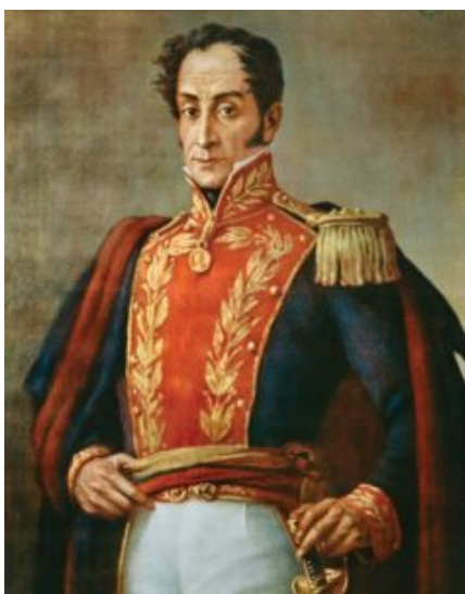
S i m o n B o l i v a