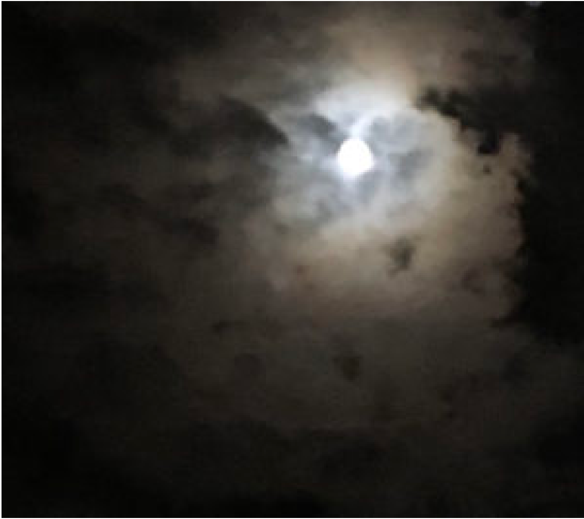
FALLS ON NIGHT / image by Amalie Flynn