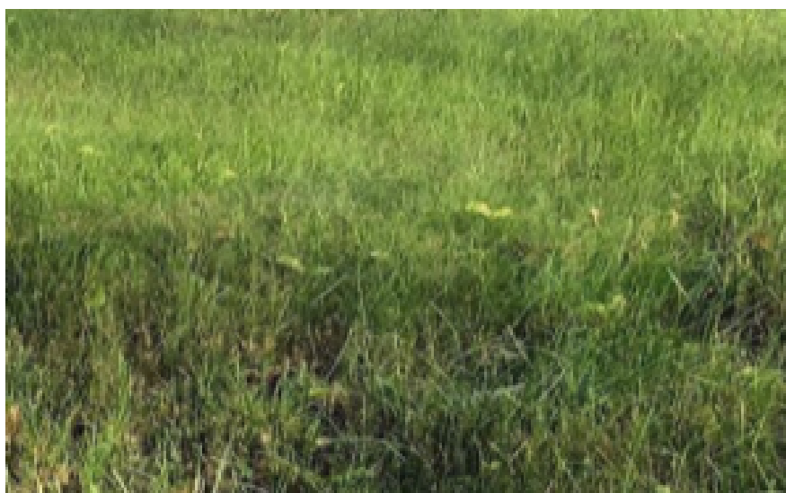
THE LUSHEST GRASS