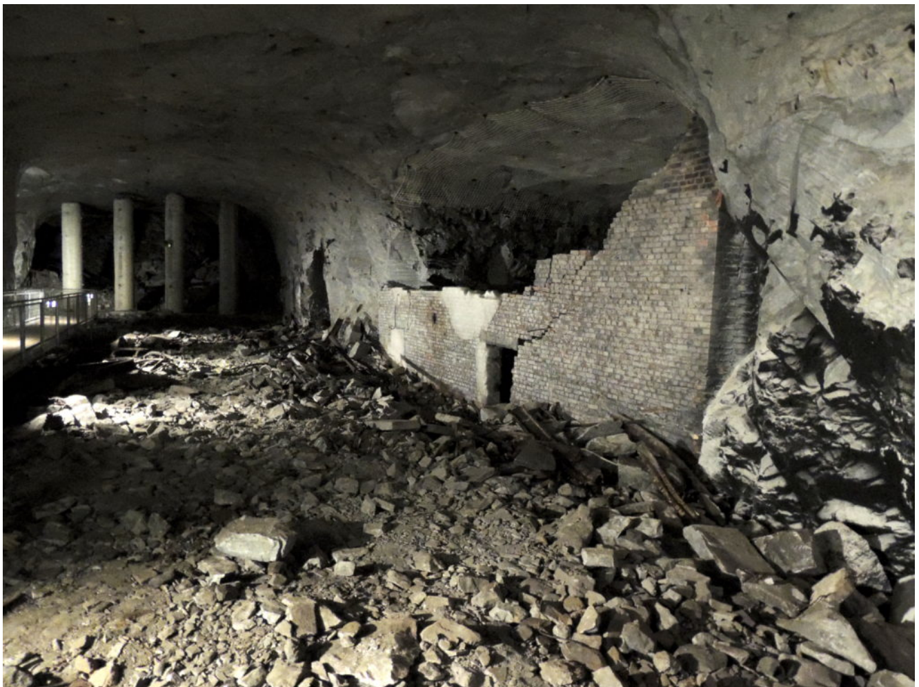
Modern-day view of the tunnels where the V-2s were made.

When they entered the tunnel, a sudden dampness fell over his skin. It felt like a heavy wet cloak had been placed over his shoulders. He began to shiver. And somewhere up ahead, metal banged against metal—it was deep and rhythmic—double-syllabled— bah-wung-bah-wung-bah-wung . There was also the low hum of a generator to his right. Floodlights cast grotesque shadows on the wall. He looked around and realized that everything he could see must have been hewn out of the rock by hand. The floor. The walls. The curved ceiling. How many prisoners had died making this place, this cave?