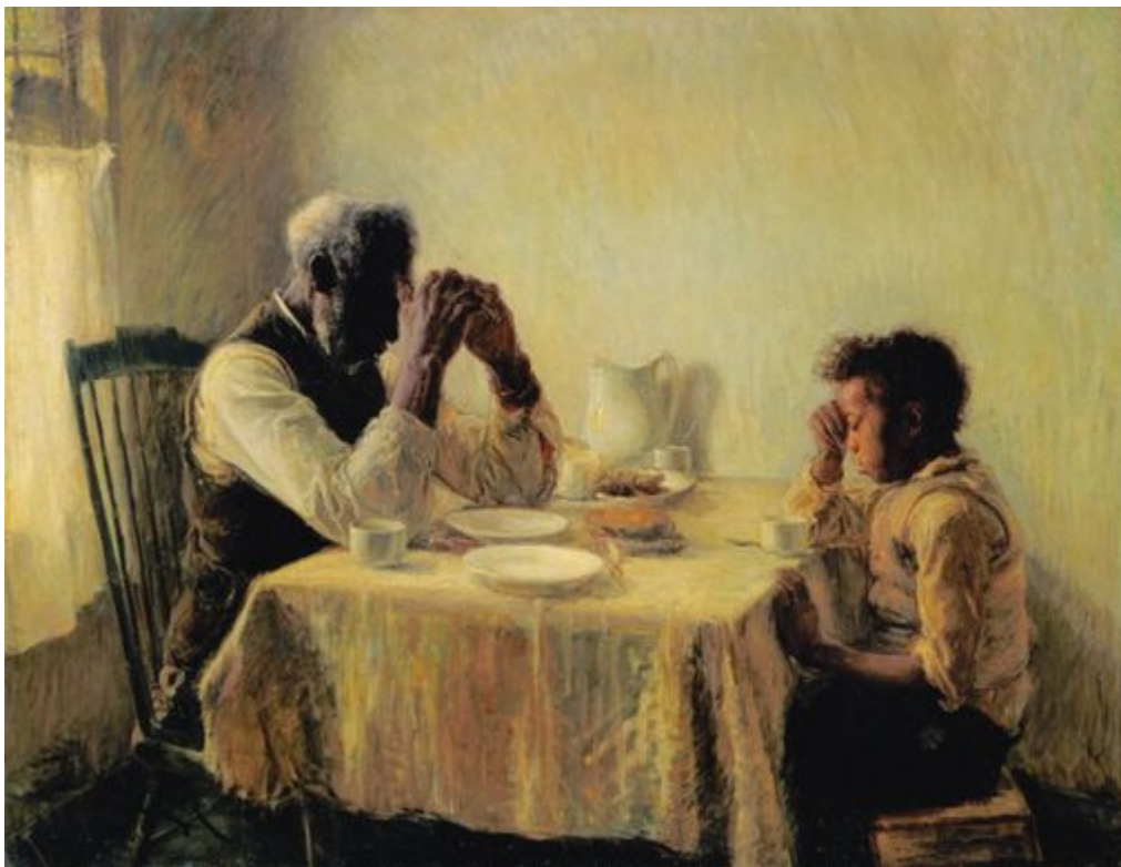
“The Thankful Poor”, Henry Ossawa Tanner, 1894

Last month in The Atlantic , Egyptian writer and activist Alaa