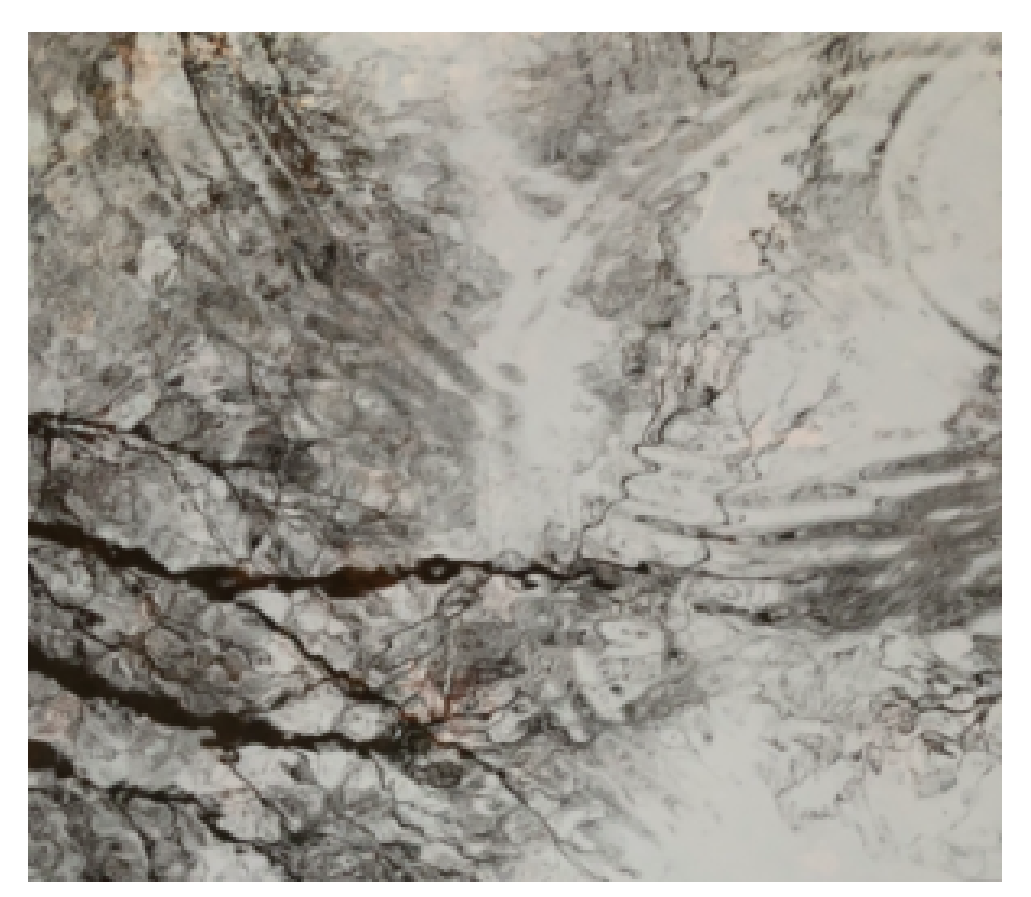
THE BROKEN SKIN / image by Amalie Flynn

New Poetry from Ben Weakley: "Beatitudes I," Beatitudes II," "Beatitudes III," "Beatitudes IV"