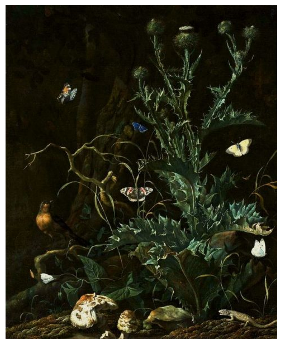
Abraham Begeyn, "Still Life with Thistle," circa 1650s.

A storm rumbles off across the valley and sunlight breaks through in its wake. The dirt road is scattered with shining blue and silver portals. He remembers walking with his mother, holding her hand, imagining being pulled through them into that underworld and drifting weightlessly. He remembers her voice, excited to show him something beautiful. How she motioned ahead: "Oh, sweetie, look!"