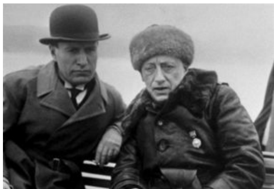
M u s s o l i n

and Mazzini. Victor Emanuel was so short (4'11") that he could not wear a real sword, and so his nickname was "Little Sabre". Italy engaged in at least five foolish wars during his reign, and he was instrumental in allowing Mussolini's Fascist regime to violently take control of the government and hold it for 22 years.