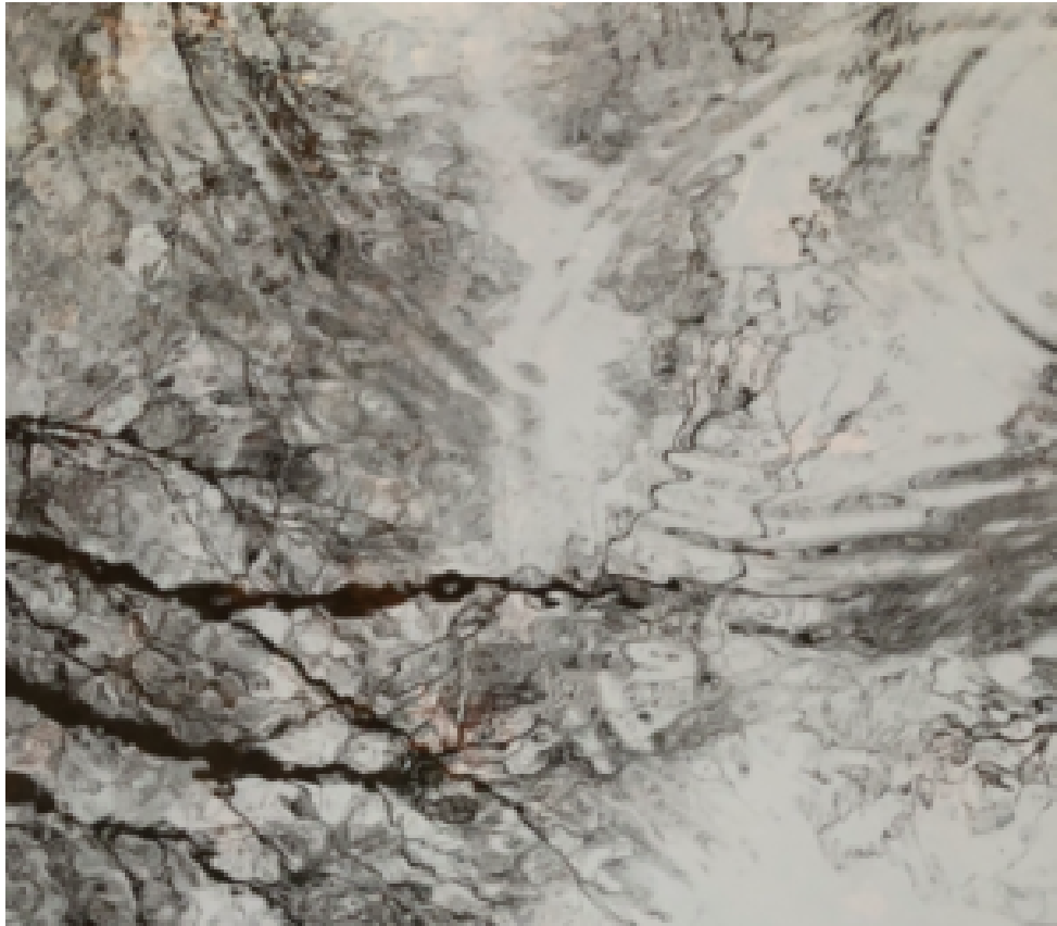
THE BROKEN SKIN / image by Amalie Flynn