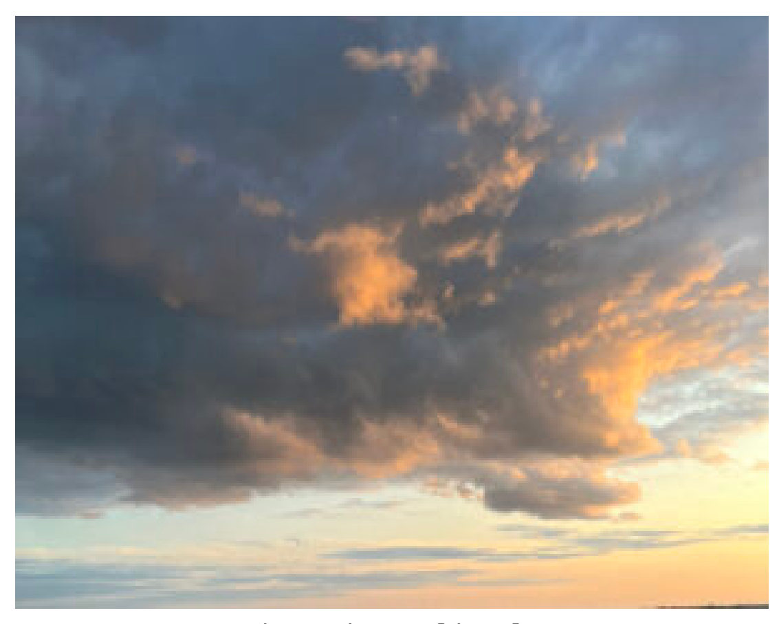
THE SILENT SKY / image by Amalie Flynn

New Poetry by Sofiia Tiapkina: "To Forget or Not Maybe," "Grasping the Sky," and "Airless Embrace"