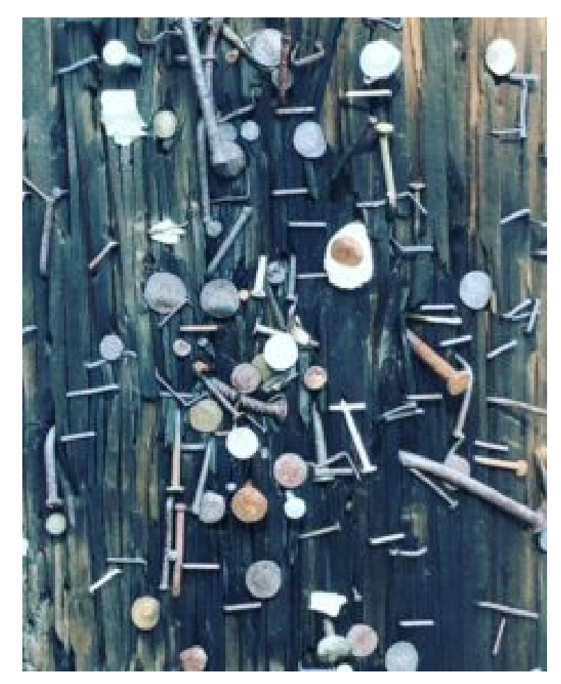
WAR HAS DONE