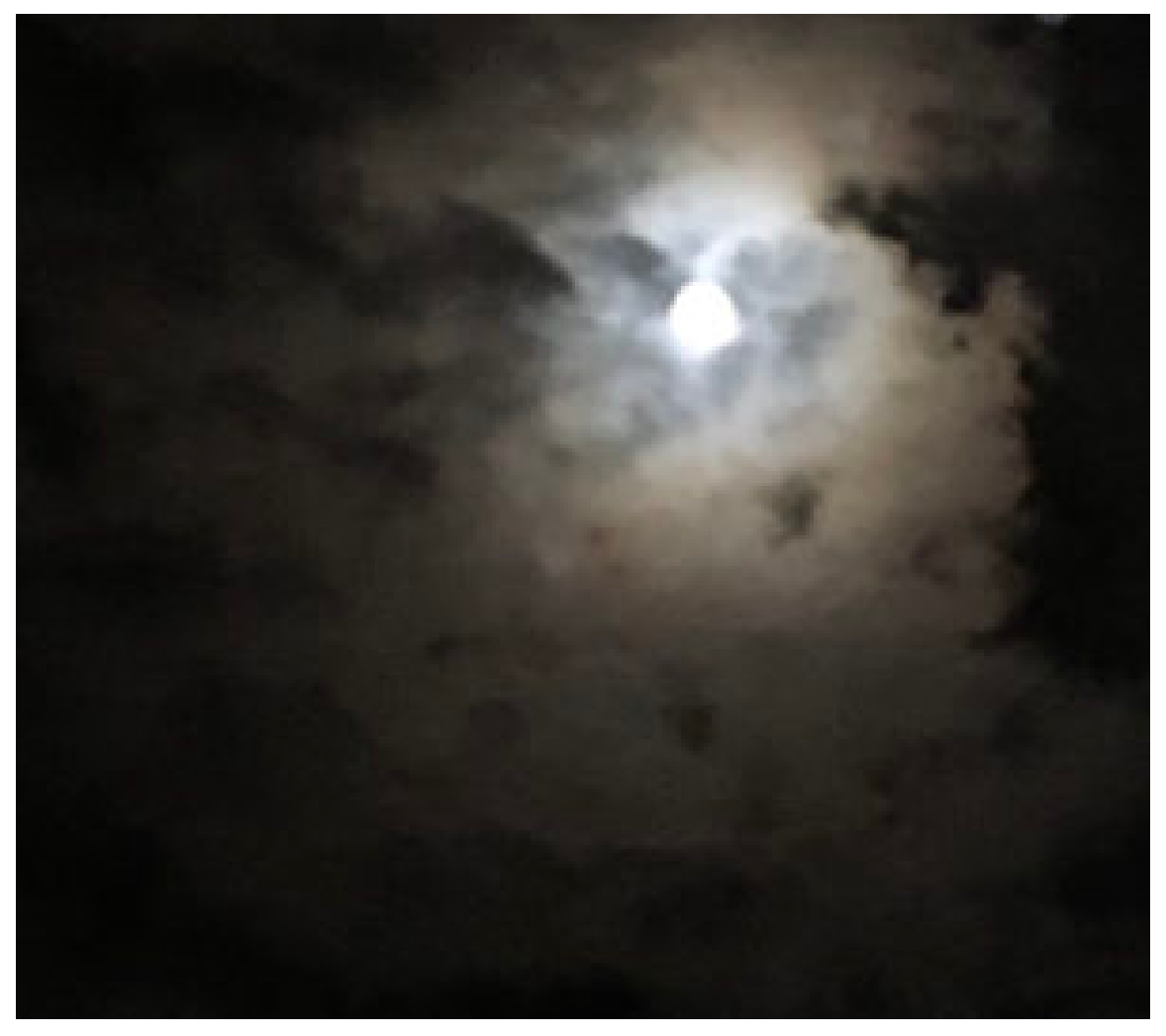
FALLS ON NIGHT