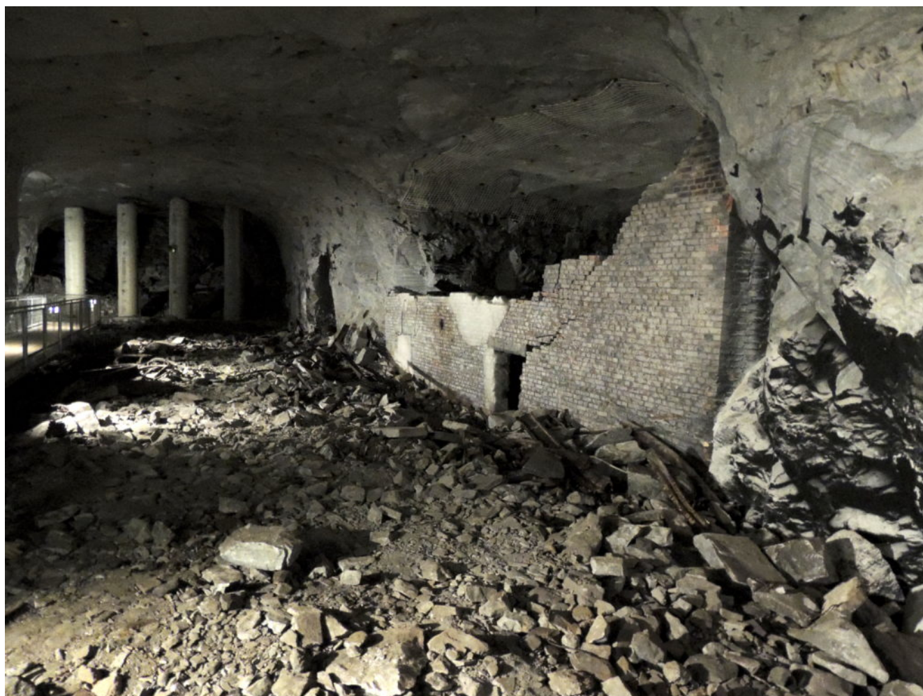
Modern-day view of the tunnels where the V-2s were made.

hum of a generator to his right. Floodlights cast grotesque shadows on the wall. He looked around and realized that everything he could see must have been hewn out of the rock by hand. The floor. The walls. The curved ceiling. How many prisoners had died making this place, this cave?