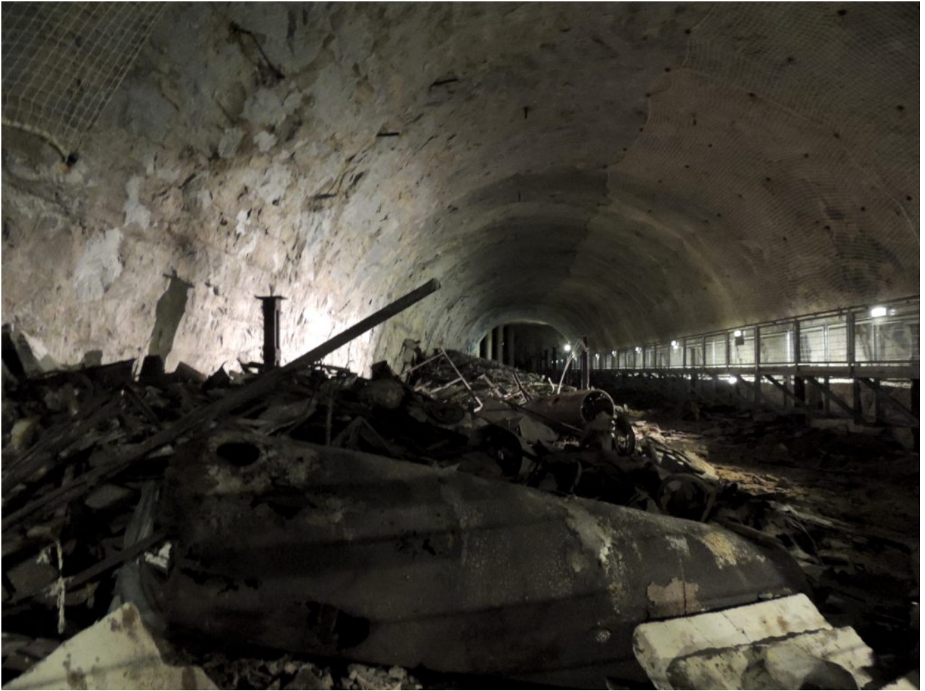
Tunnels where the V-2s were made.

And so, deep in the Harz Mountains, prisoners had to blast tunnels into the earth to create this factory. Thousands of lives were lost and, today, no one really knows about Dora-Mittelbau because what was built there—the rockets—were top secret when America discovered the camp. It was hidden from the press. We didn't want the world to know much about the V-2s, so the horrors of this camp weren't put in the public eye the way that Dachau, Auschwitz, Buchenwald, and Bergen-Belsen were. Even today, the name "Dora-Mittelbau" means very little to most people.