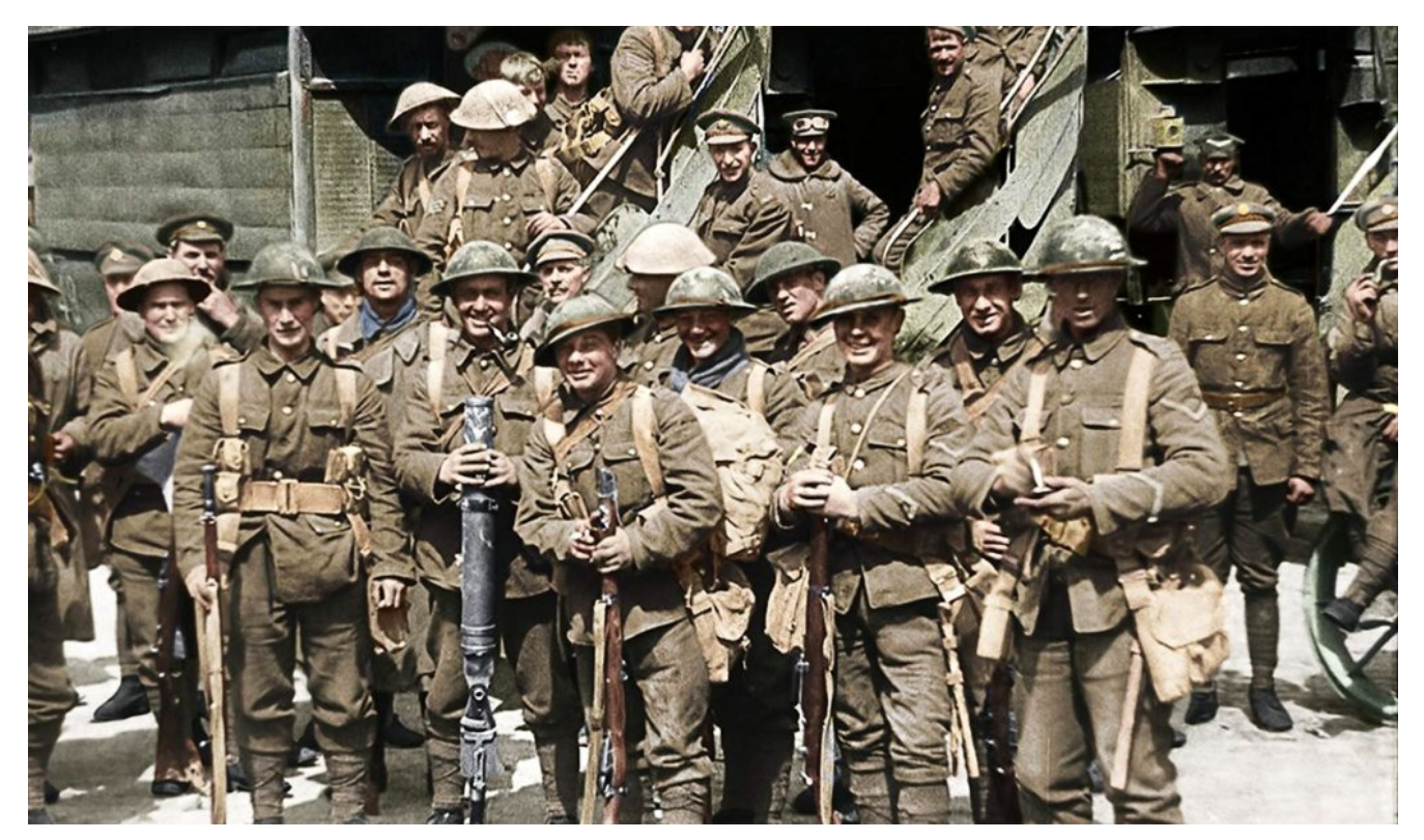
Still from Peter Jackson's 'They Shall Not Grow Old.'

decision to represent the War exclusively from the perspective of the people who actually fought the damn thing, the narrative feels tailored nonetheless. Blame it perhaps on the source material, as the archival audio was taken from something like 600 hours of interviews done in the '50s and '60s by the Imperial War Museums, who clearly have their own version of the War they wish to promote. A version of the war where the sun still has not set on the British Empire, George V regards us all favorably from the wall of every post office, the tea is hot and everyone knows their place.