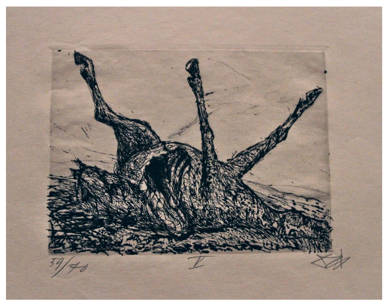
Otto Dix, "Horse Cadaver from the War."

Many times Jackson shows bodies dangling, untended and ignored, from barbed wire, akin to those from the War Triptych or the obviously named but no less striking Corpse on Barbed Wire .