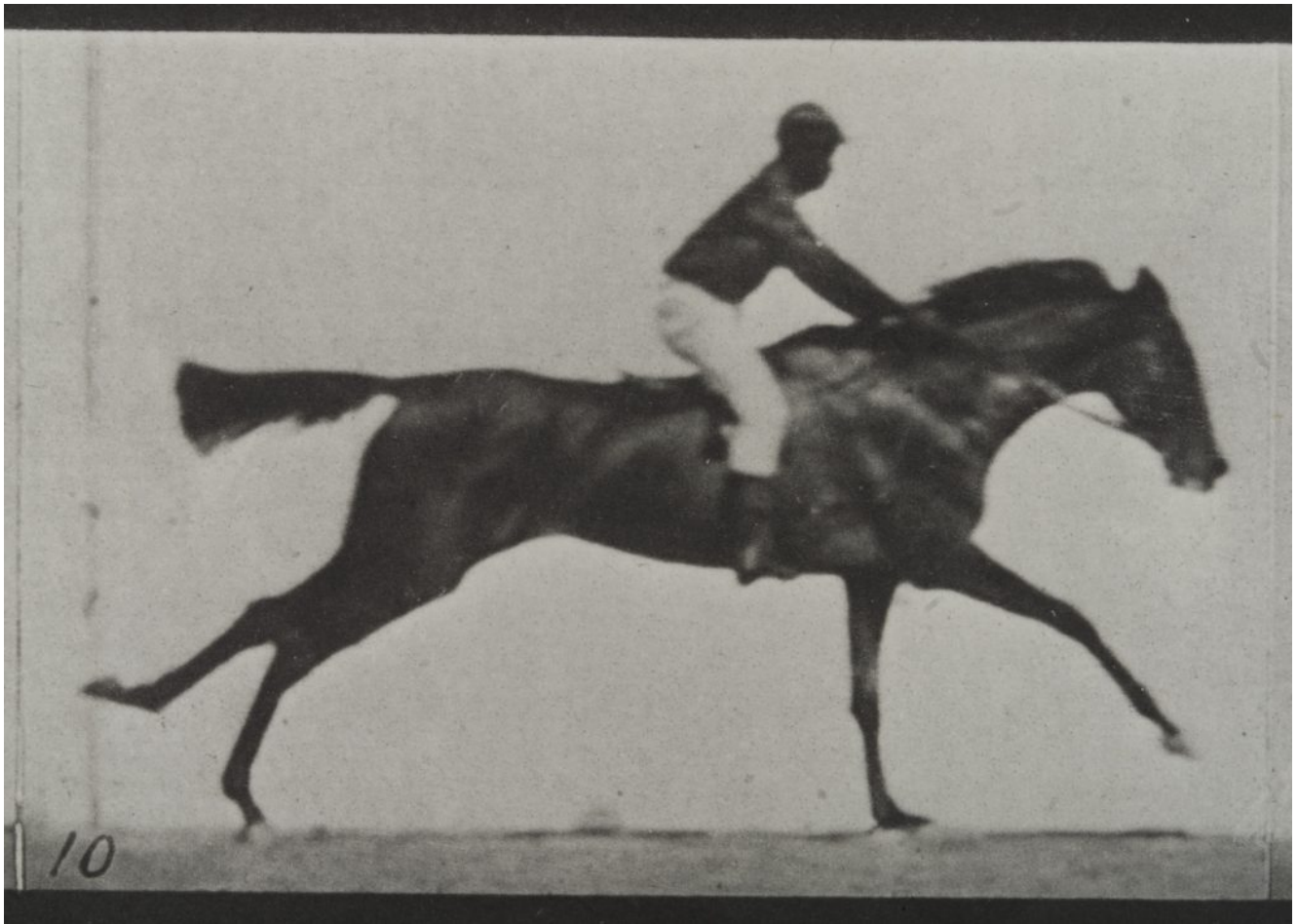
1887. Eadweard Muybridge. Wellcome Gallery, London.